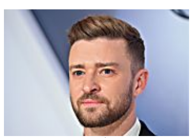
PrettyFamous | By Graphiq | Sponsored